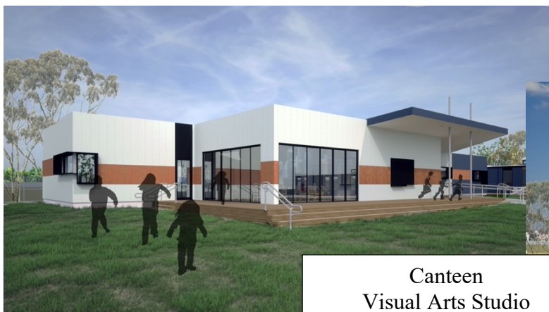
Canteen Visual Arts Studio STEM Room Community Room

After receiving $7.9 million last year from the State Government as part of the second stage of capital works project at St Albans East PS, we are delight to showcase the next instalment of building works. We have been working closely with the Victorian Schools Building Authority (VSBA) and FMSA Architects to plan and design the next stage of our works. I have no doubt the school community will benefit from the new facilities and importantly support teaching and learning programs at SAEPS.