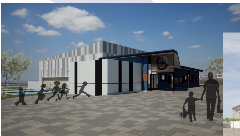
Gymnasium Performing Arts Center Before & After school care